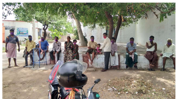
Maintaining Social Distance Educating on Nutriton