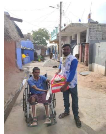
Nutrition Food Distribution to the SCI Persons

e) Demonstrating social measures on COVID-19 such as Social Distance, Washing Hands frequently, increasing Immunity by taking Nutriton diet.