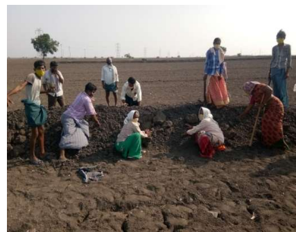
MGNREG SCHEME EXERCISING BY PWDs