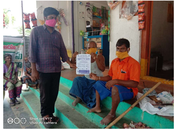
Educating by distributing Pamphlets

c) Training to the all staff members on CBR/CBID guidelines on COVID-19.