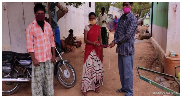
Mask Distribution to Sangha members