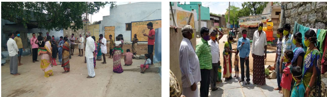
Creating Awareness on COVID-19 by Staff

The staff taken special drive on practicing measures by SHGs of PWDs, CARERS and Other community members in villages. The Sanghas gave a feed back to SACRED CBR staff hard working educating community through Pamphlets, Masks and Nuitrition food grains distribution.